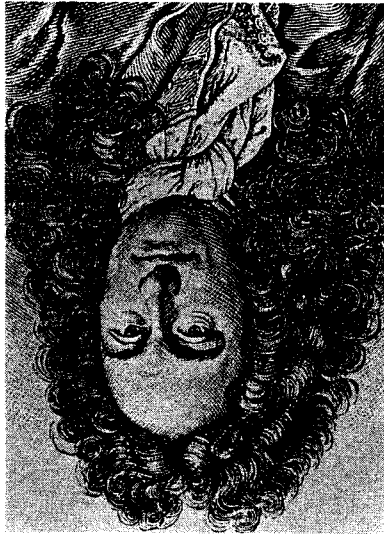
Gottfried Wilhelm Leibniz

temp, sickness, torment, and death for them as nothing—indeed, even sweet.