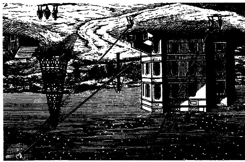
The Paris Observatory, 1705.

instrument; but whose invaluable talent, if hidden away, will be extremely difficult for them. The corruption and the putrefaction of the best from excessive idleness is worst of all. It is a crucial point, on which blessedness and mortal justice depends, to properly use one's reason and power for God's glory. Thus, I believe a conscientious man should not accept the Philosopher's Stone—to which is attached that difficult condition, which invariably attaches to all great power—without fear and trembling, so that he may never hear the harsh words, "Be damned with all your wealth!"